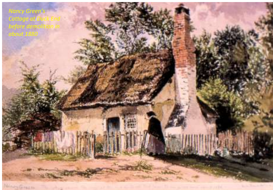
Nancy Green's Cottage at Duck End before demolition in about 1880